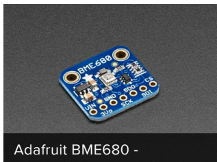
Adafruit BME680 -