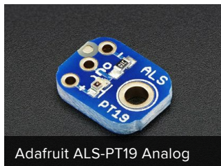
Adafruit ALS-PT19 Analog