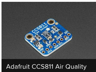
Adafruit CCS811 Air Quality