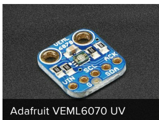
Adafruit VEML6070 UV