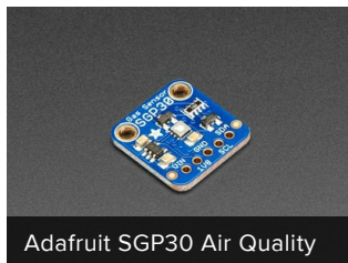
Adafruit SGP30 Air Quality