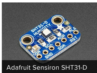
Adafruit Sensiron SHT31-D