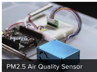
PM2.5 Air Quality Sensor