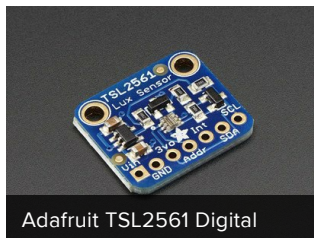
Adafruit TSL2561 Digital