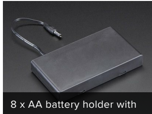
8 x AA battery holder with