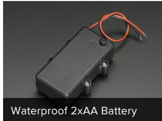
Waterproof 2xAA Battery