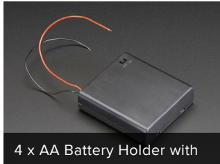
4 x AA Battery Holder with