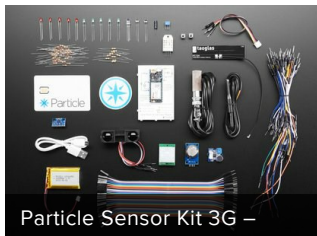
Particle Sensor Kit 3G –