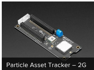
Particle Asset Tracker – 2G