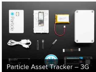
Particle Asset Tracker – 3G