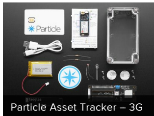
Particle Asset Tracker – 3G