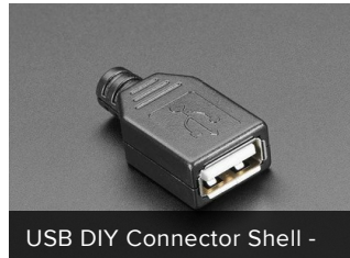
USB DIY Connector Shell -