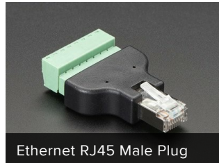
Ethernet RJ45 Male Plug