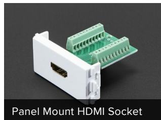
Panel Mount HDMI Socket