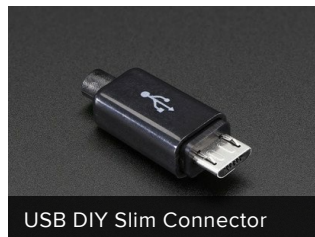
USB DIY Slim Connector