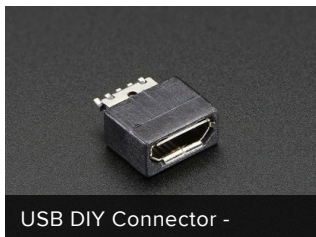
USB DIY Connector -