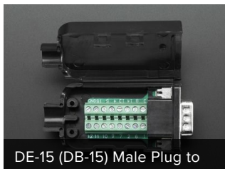
DE-15 (DB-15) Male Plug to