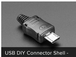
USB DIY Connector Shell -