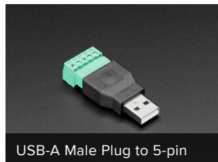
USB-A Male Plug to 5-pin