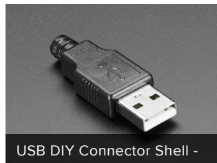
USB DIY Connector Shell -