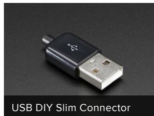
USB DIY Slim Connector