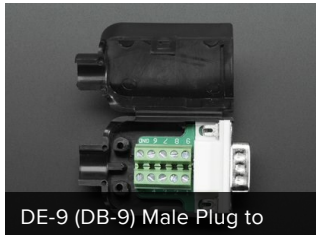
DE-9 (DB-9) Male Plug to