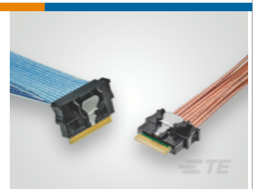
TE Part # 2821638-1 SLIVER C/A, 50P, STR TO R/A, 10GHZ, 85OHM