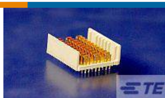
TE Part # 6469085-1 HMZD 3PAIR, HDR ASSY, 25MM MOD