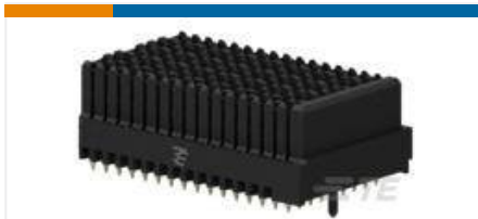
TE Part # 1410142-2 MULTIGIG RT T2 .8\" BP FULL RGH