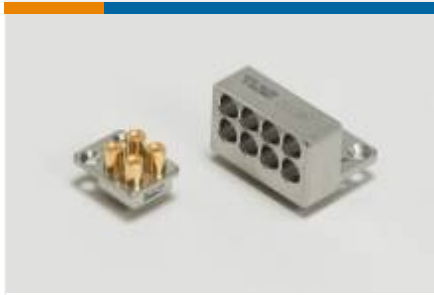
PCB RF Modules (12)