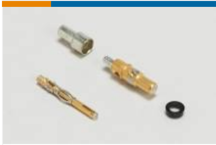
Coax Contacts (2)