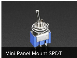
Mini Panel Mount SPDT