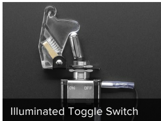
Illuminated Toggle Switch