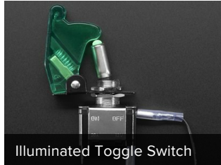
Illuminated Toggle Switch