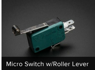
Micro Switch w/Roller Lever