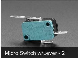
Micro Switch w/Lever - 2