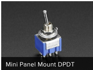
Mini Panel Mount DPDT