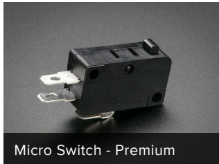
Micro Switch - Premium