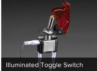
Illuminated Toggle Switch