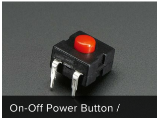
On-Off Power Button /