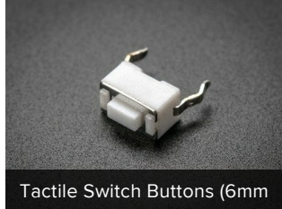
Tactile Switch Buttons (6mm)