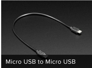
Micro USB to Micro USB