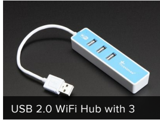
USB 2.0 WiFi Hub with 3