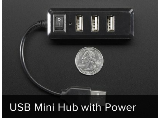
USB Mini Hub with Power