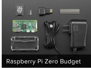
Raspberry Pi Zero Budget