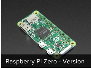
Raspberry Pi Zero - Version