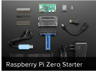
Raspberry Pi Zero Starter