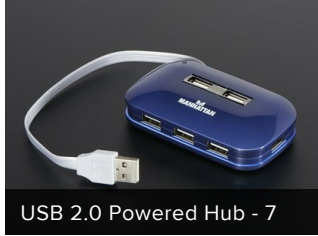
USB 2.0 Powered Hub - 7