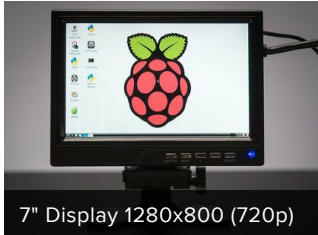
7" Display 1280x800 (720p)