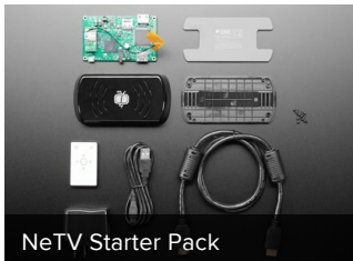
NeTV Starter Pack