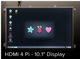
HDMI 4 Pi - 10.1" Display