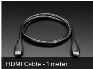
HDMI Cable - 1 meter