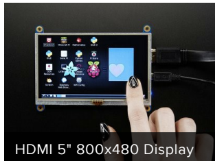
HDMI 5" 800x480 Display