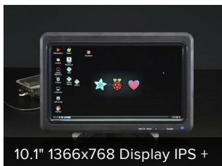
10.1" 1366x768 Display IPS +