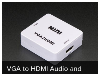
VGA to HDMI Audio and