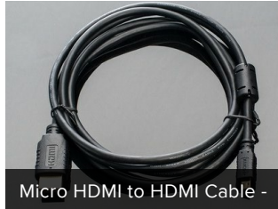
Micro HDMI to HDMI Cable -