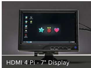
HDMI 4 Pi - 7" Display