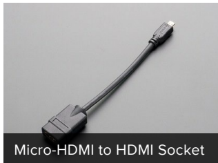
Micro-HDMI to HDMI Socket