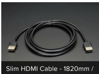
Slim HDMI Cable - 1820mm /