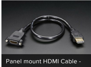
Panel mount HDMI Cable -