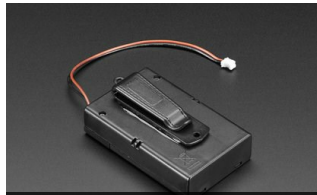
3 x AA Battery Holder with