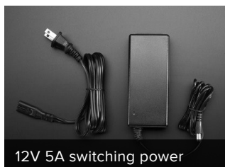
12V 5A switching power