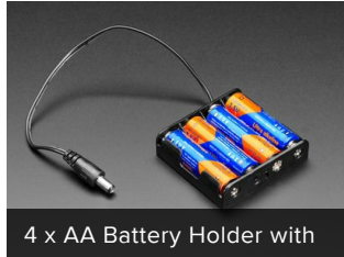
4 x AA Battery Holder with