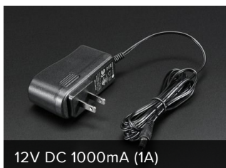
12V DC 1000mA (1A)