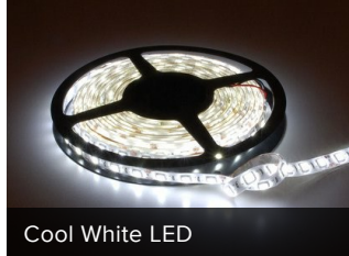
Cool White LED