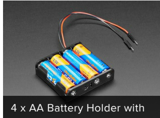
4 x AA Battery Holder with