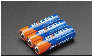
Alkaline AA batteries (LR6) -