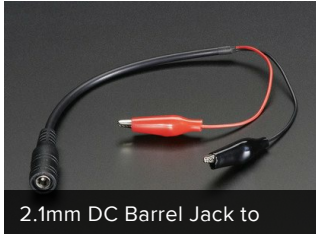
2.1mm DC Barrel Jack to