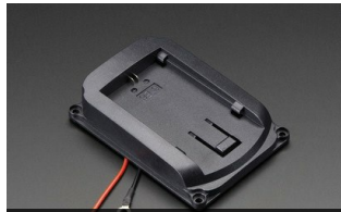
Camcorder Battery Holder