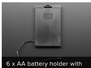
6 x AA battery holder with