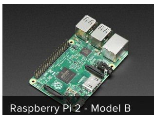
Raspberry Pi 2 - Model B