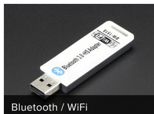
Bluetooth / WiFi