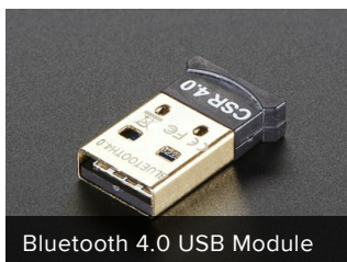
Bluetooth 4.0 USB Module