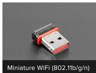
Miniature WiFi (802.11b/g/n)