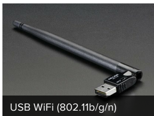
USB WiFi (802.11b/g/n)