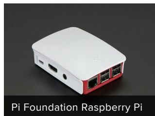
Pi Foundation Raspberry Pi