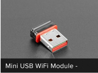
Mini USB WiFi Module -