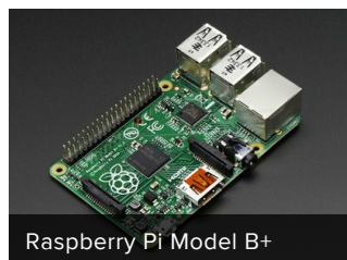
Raspberry Pi Model B+