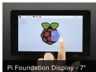
Pi Foundation Display - 7"