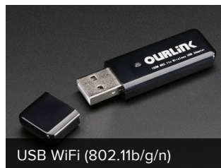
USB WiFi (802.11b/g/n)