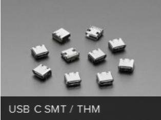
USB C SMT / THM