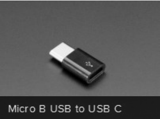
Micro B USB to USB C