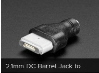
2.1mm DC Barrel Jack to