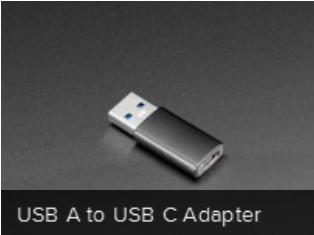
USB A to USB C Adapter