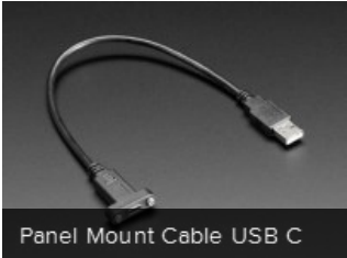
Panel Mount Cable USB C