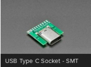
USB Type C Socket - SMT