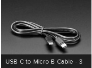
USB C to Micro B Cable - 3