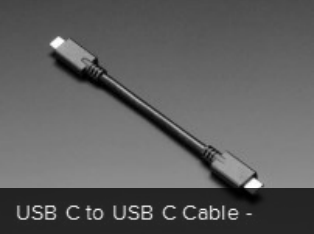
USB C to USB C Cable -