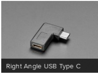
Right Angle USB Type C