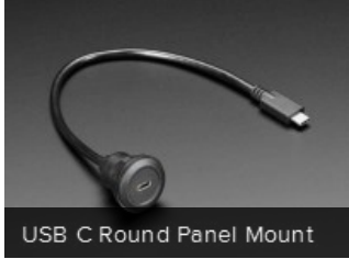
USB C Round Panel Mount