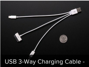
USB 3-Way Charging Cable -