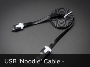
USB 'Noodle' Cable -