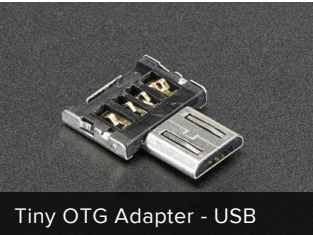
Tiny OTG Adapter - USB