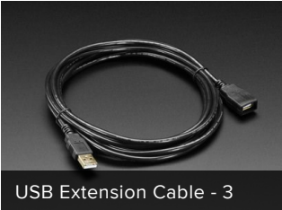
USB Extension Cable - 3