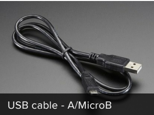
USB cable - A/MicroB