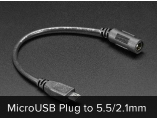
MicroUSB Plug to 5.5/2.1mm