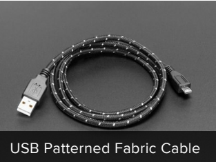
USB Patterned Fabric Cable