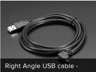
Right Angle USB cable -