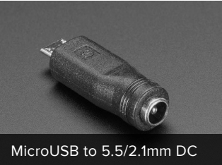
MicroUSB to 5.5/2.1mm DC