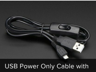
USB Power Only Cable with