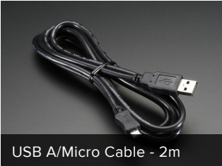
USB A/Micro Cable - 2m