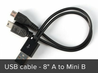
USB cable - 8" A to Mini B