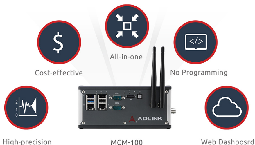
Figure 2. The MCM-100 is an easily integrated, complete and remote vibration monitoring solution.

Without a doubt, the MCM-100 lowers the total cost of ownership of equipment with vibration concerns. Manufacturers are able to maintain equipment proactively and efficiently, without risking interruptions from downtimes. Manufacturers have a lot to gain from a high-tech, intelligent monitoring solution like the MCM-100 — and nothing to lose that isn't already at risk today.